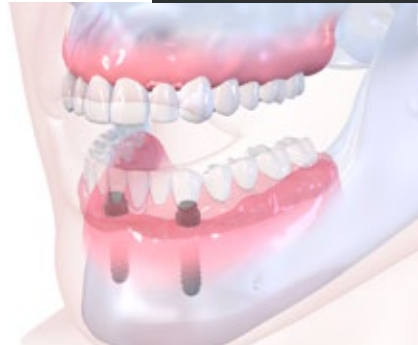
Straumann® Novaloc Retentive System with regular implants