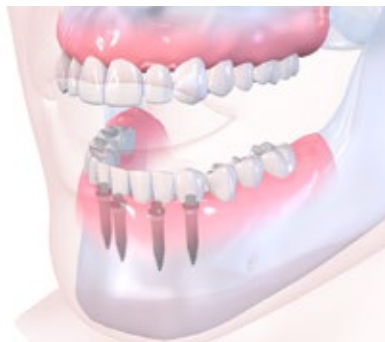
Straumann® Mini Implant System

There are different kinds of implants onto which your new teeth can be fixed and different click-fix systems to attach your teeth on the implants.